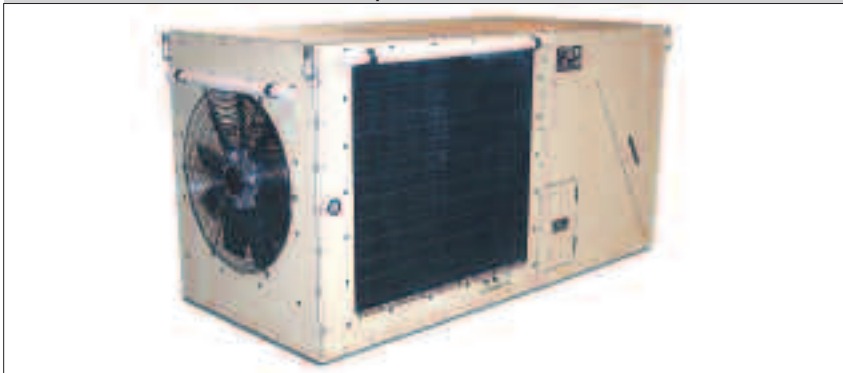
Covers stowed/Rear view condenser coil and fan